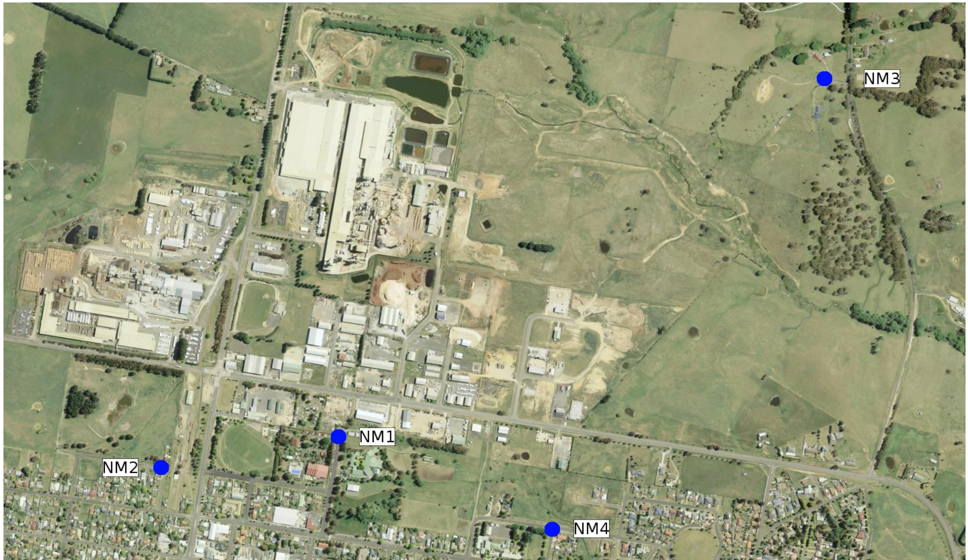
Figure 1: Attended Noise Monitoring Locations